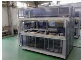
Attaching equipment