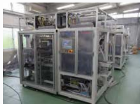
Polisher and washer